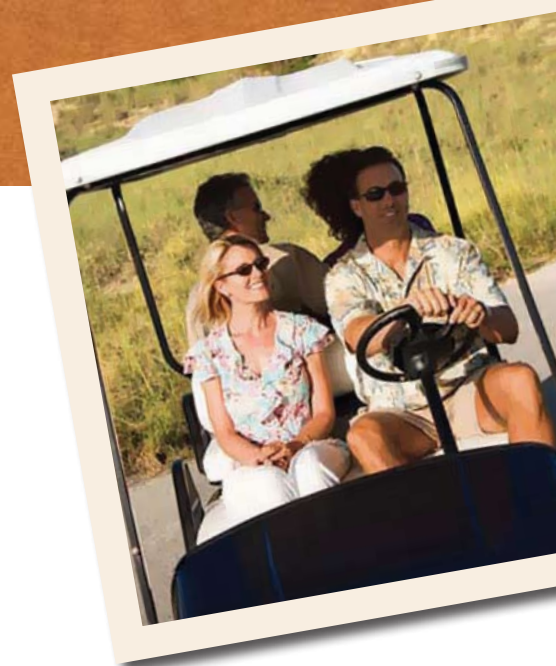
Willow Springs Golf course, established in 1966 is just a short golf cart ride away.